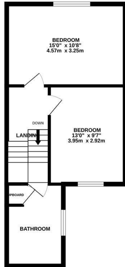
1ST FLOOR 418 sq.ft. (38.8 sq.m.) approx.